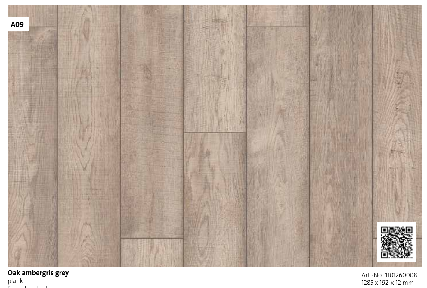
Oak ambergris grey plank linear brushed