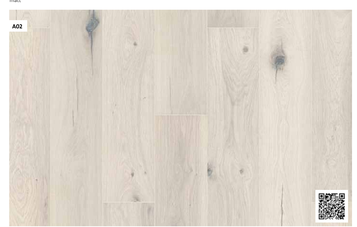
Oak alabaster plank linear brushed matt