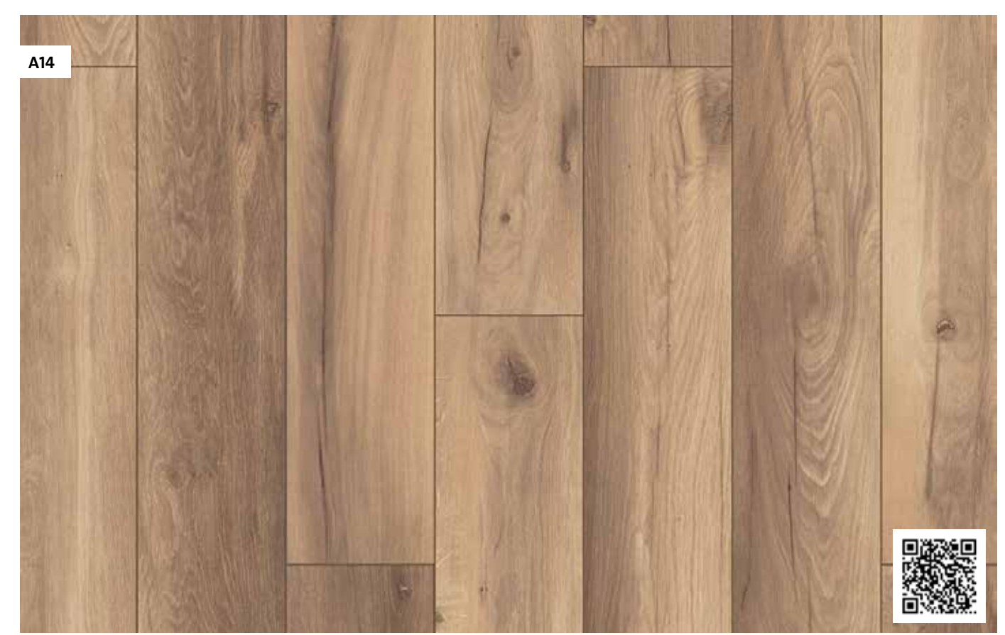
Oak roman brown plank linear brushed matt