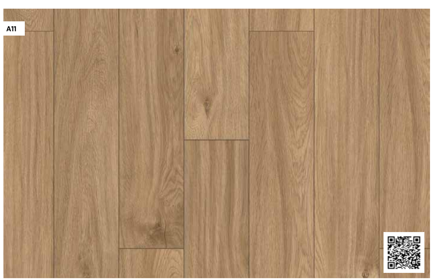
Oak indian brown plank . linear brushed matt