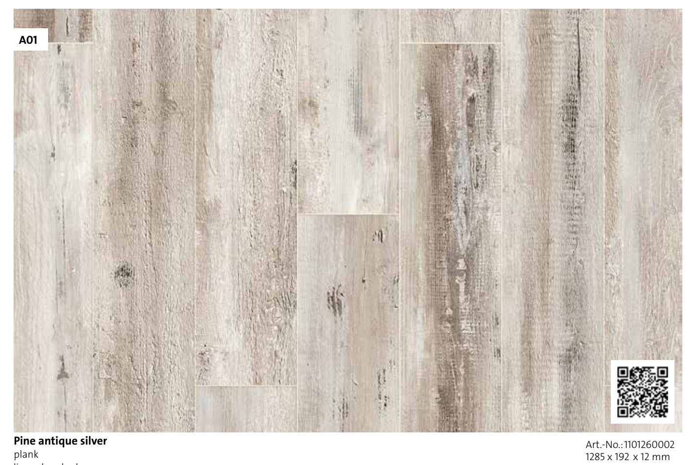
Pine antique silver plank linear brushed matt