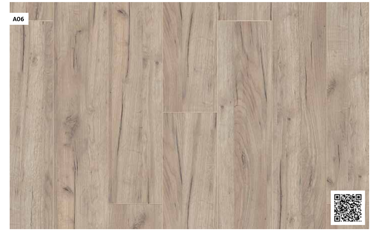
Oak nordic beige plank linear brushed matt