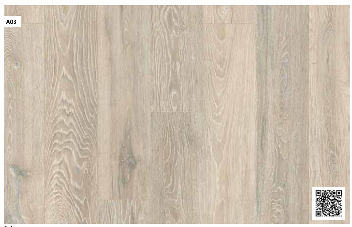
Oak moon grey plank register embossed/fine brushed matt