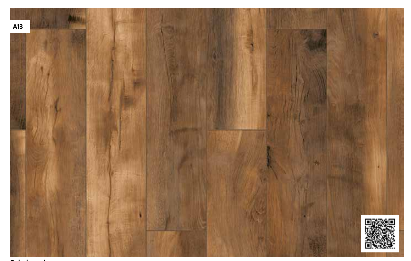
Oak chamois plank register embossed/fine brushed/sculptured matt