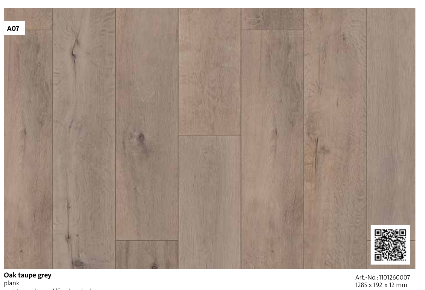
Oak taupe grey register embossed/fine brushed