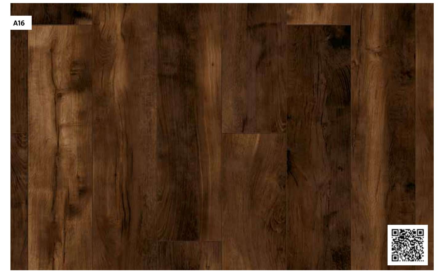
Oak Cuba brown plank register embossed/fine brushed matt