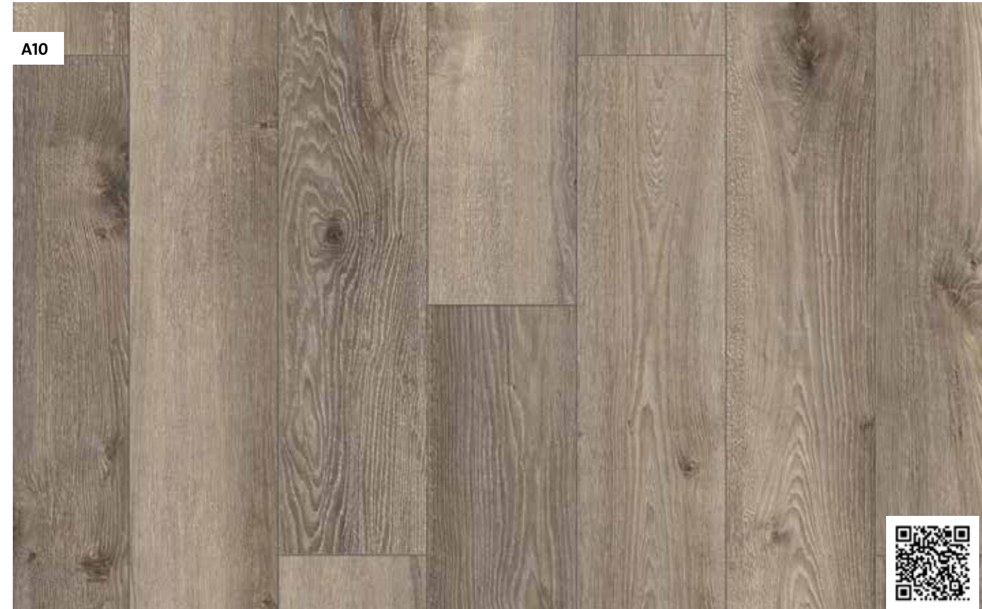
Oak shadow grey plank linear brushed matt