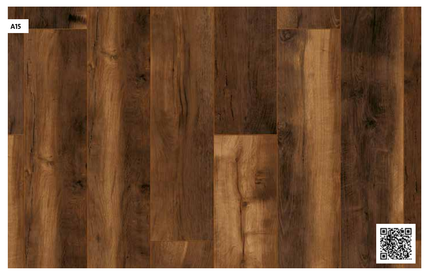
Oak Bordeaux brown plank register embossed/fine brushed/sculptured matt