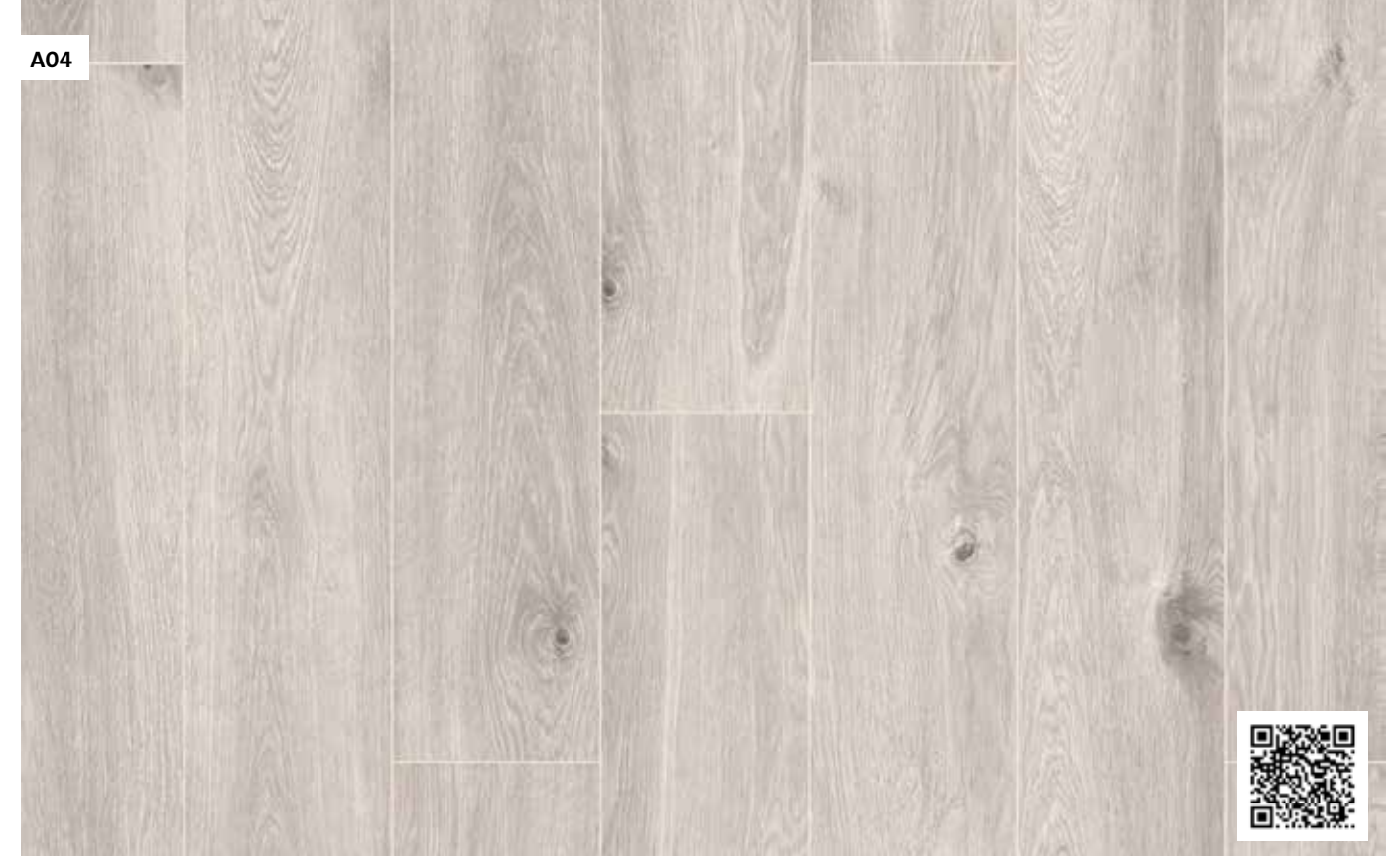
Oak velvet grey plank linear brushed matt