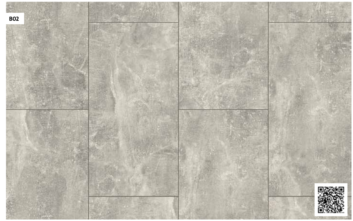
Stone star grey natural stone fine structured matt