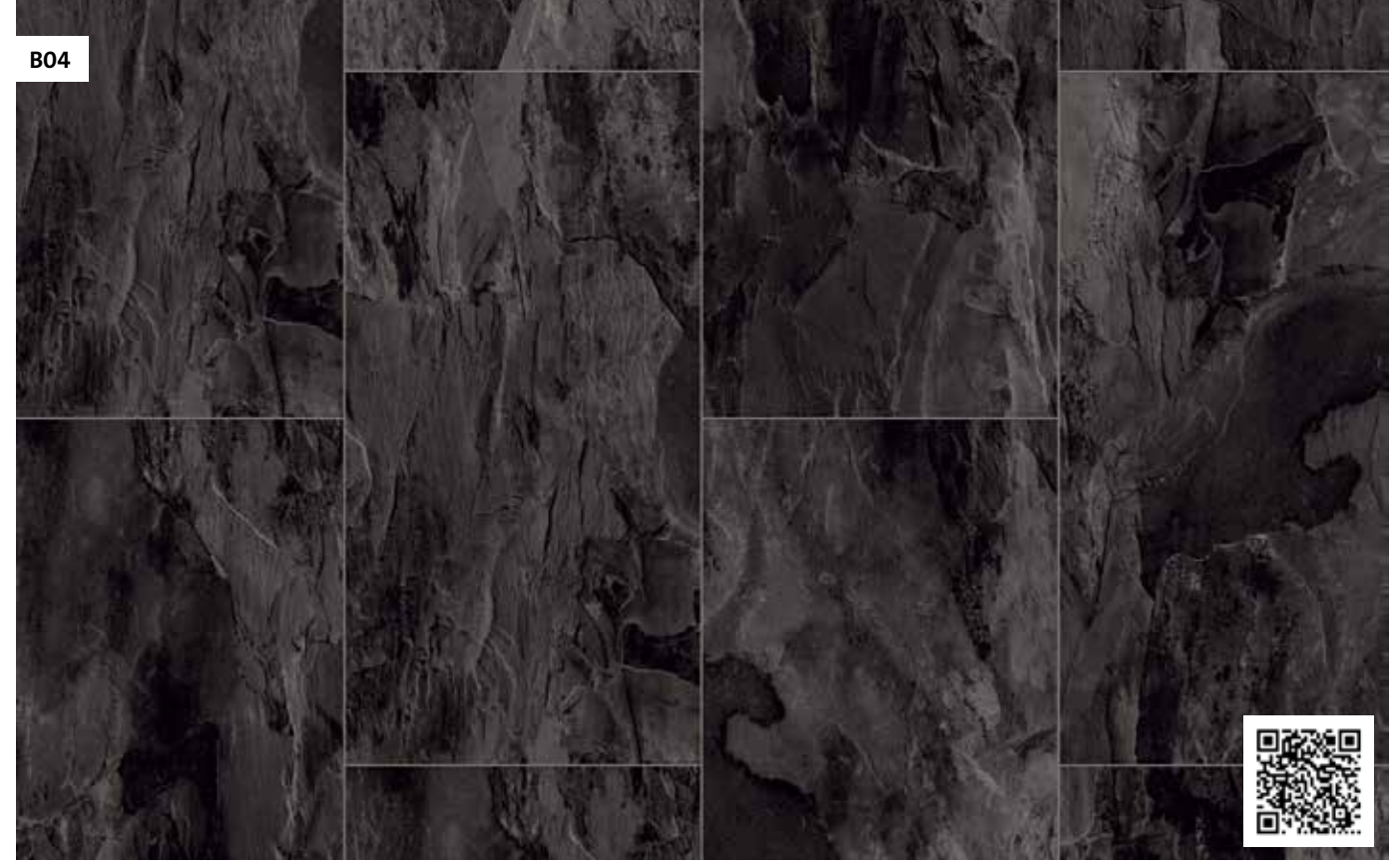
Stone manganese grey natural stone register embossed/fine structured matt