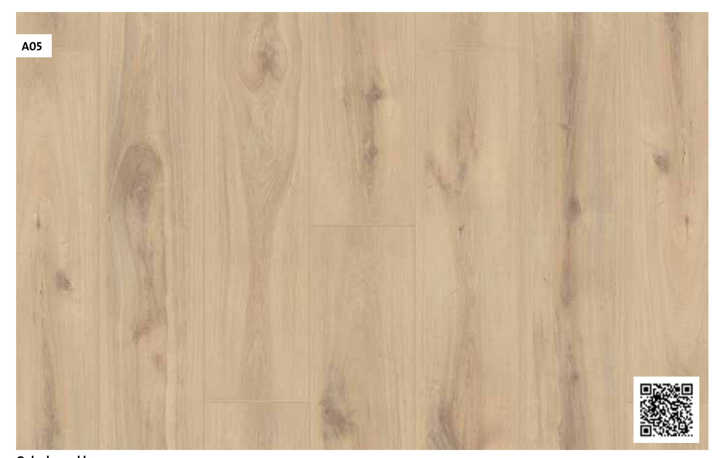
Oak almond brown plank linear brushed matt