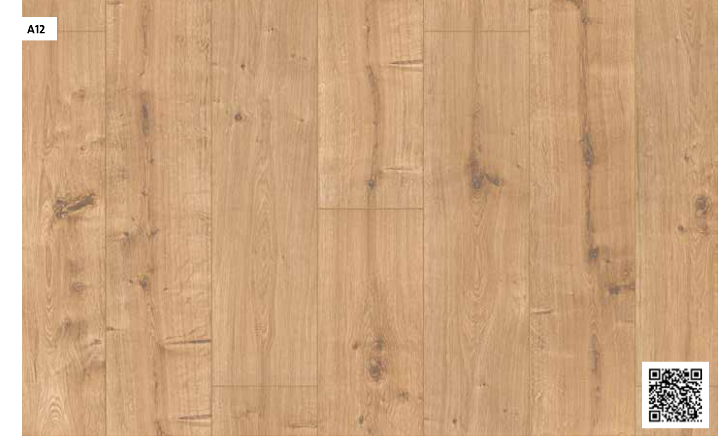
Oak sahara beige plank smooth matt