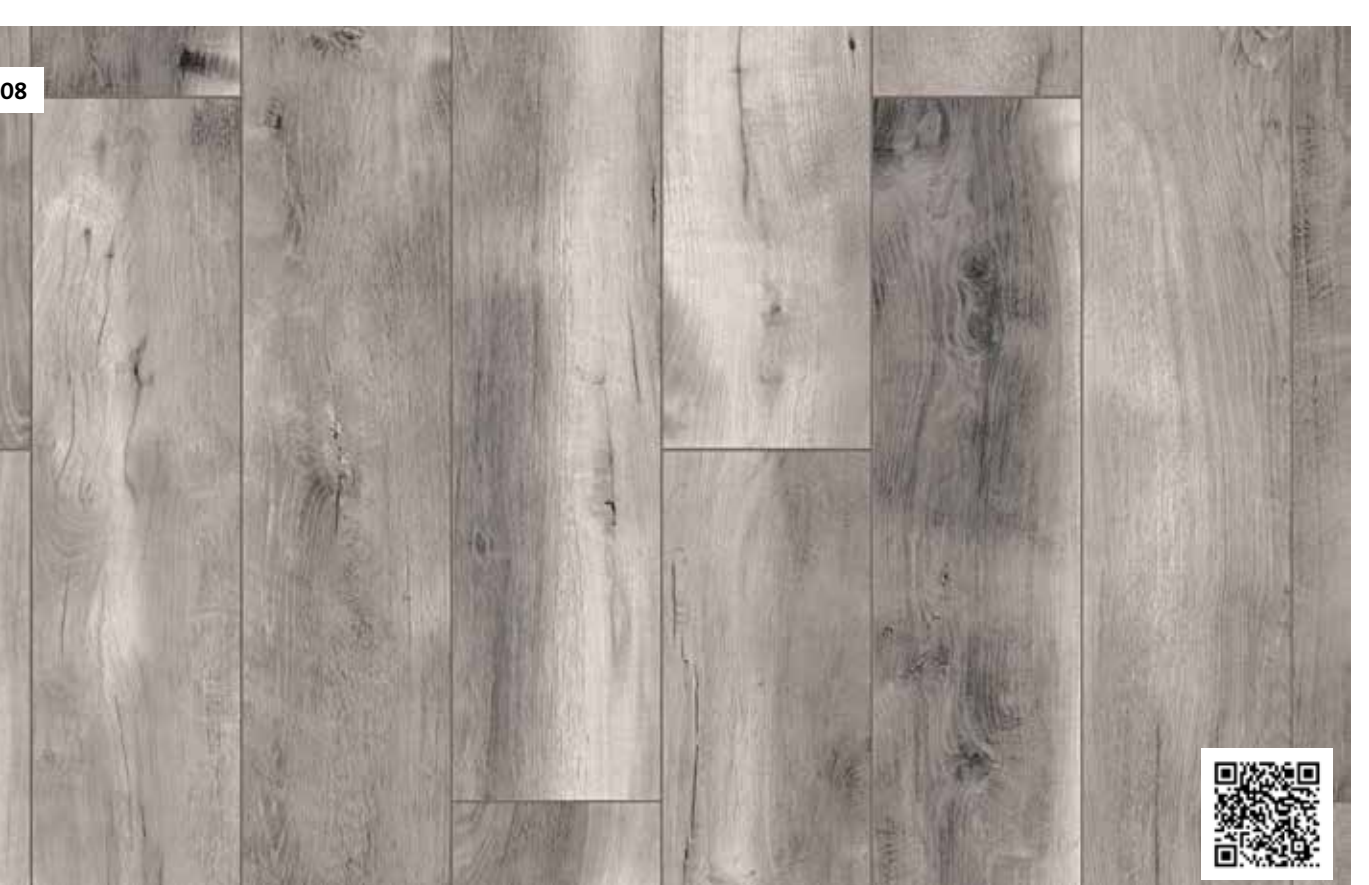
Oak rustic grey plank register embossed/fine brushed/sculptured matt