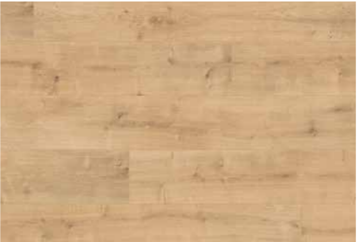
Oak Burger Grill* 1101021834 | 1285 x 192 x 8 mm | plank