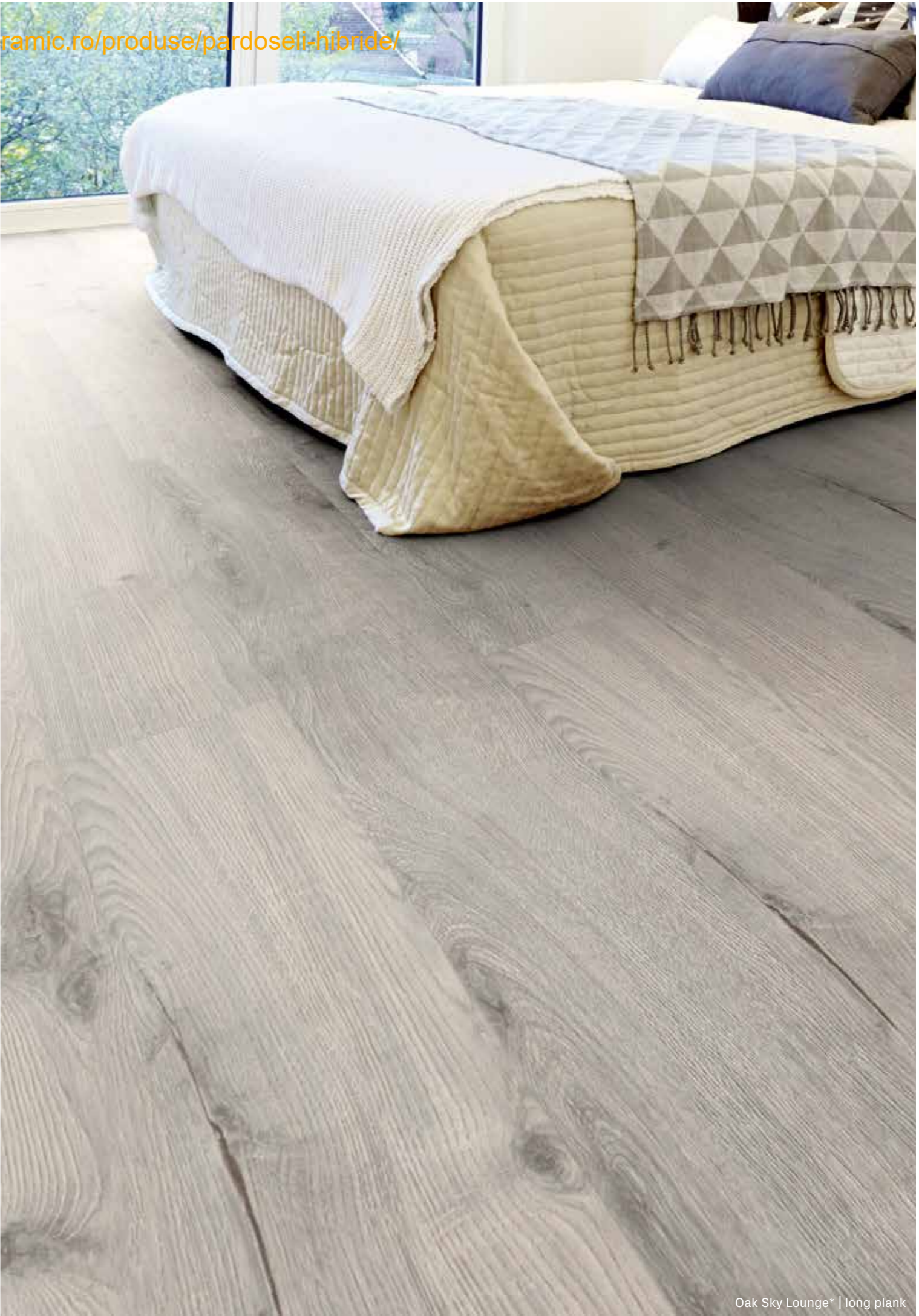
Oak Sky Lounge* | long plank

Distribuitor in Romania - https://gadaceramic.ro/produse/pardoseli-hibride/