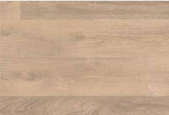
Oak French Bistro* 1101021838 | 1288 x 195 x 8 mm | plank