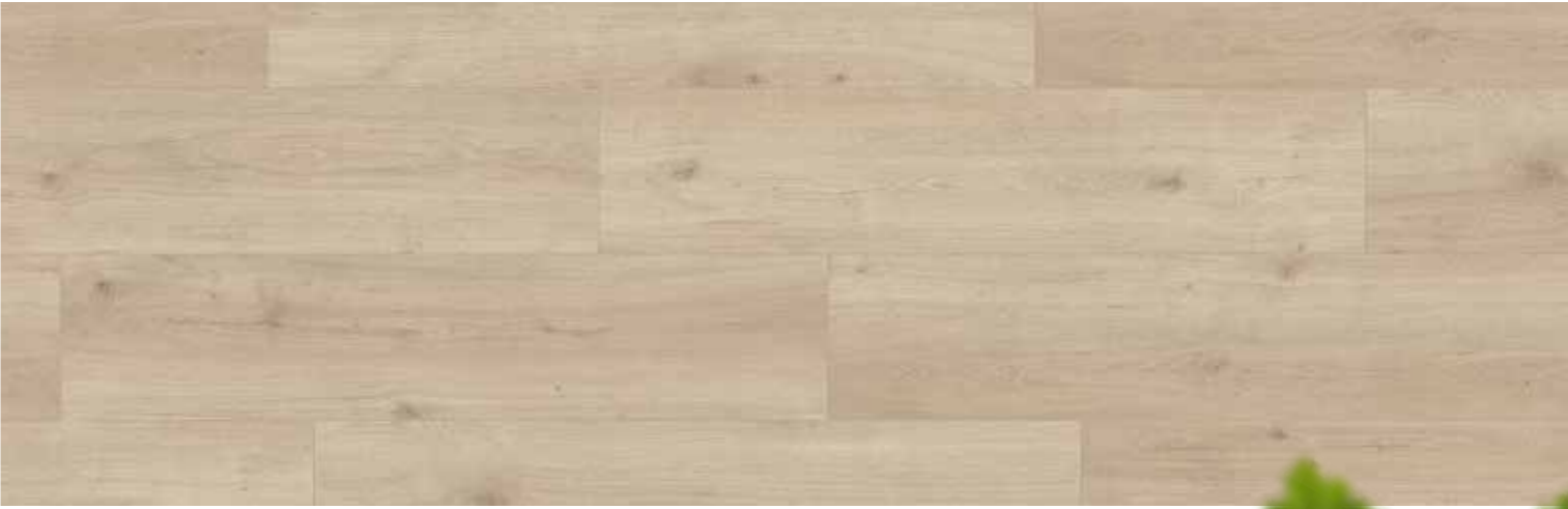
Oak Hygge* 1101021825 | 1285 x 280 x 8 mm | wide plank