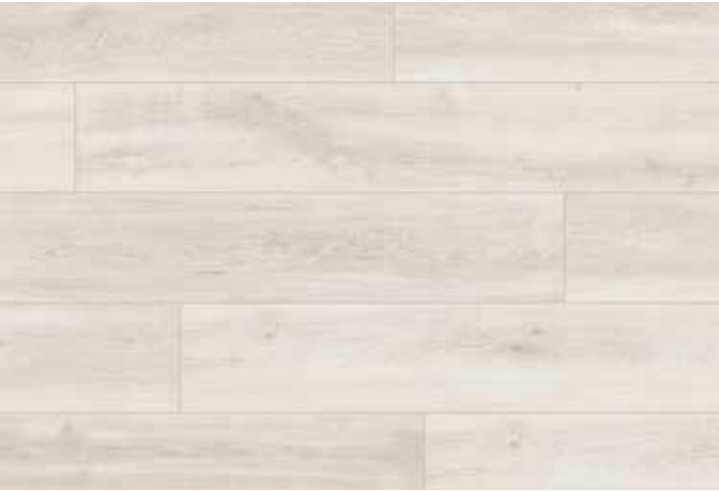
Oak Sushi Bar* 1101021820 | 1285 x 192 x 8 mm | plank