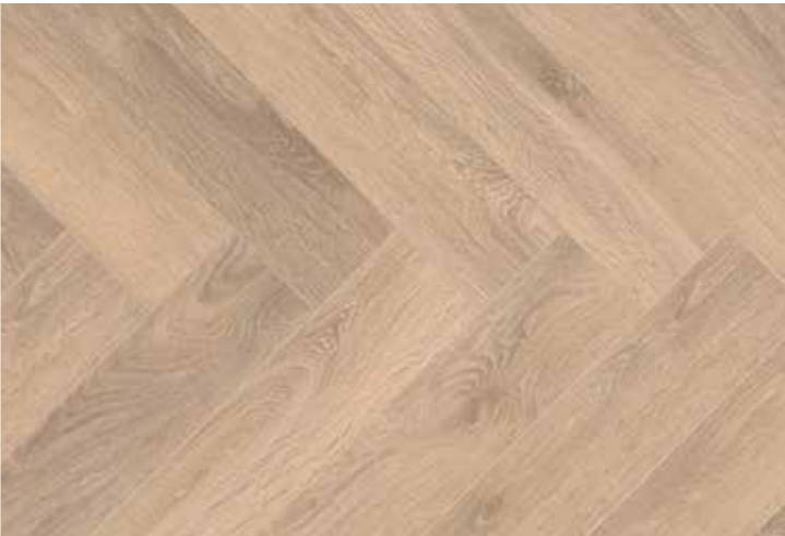
Oak Chalet* 1101021853 | 630x126x10 mm | herringbone