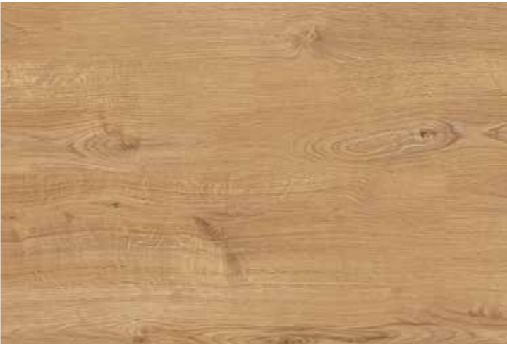
Oak Opera House* 1101021832 | 1288 x 195 x 8 mm | plank