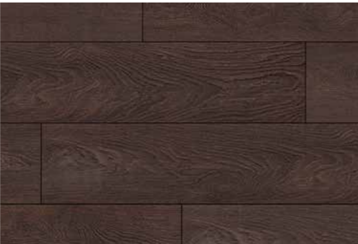
Oak Irish Pub* 1101021842 | 1288 x 195 x 8 mm | plank