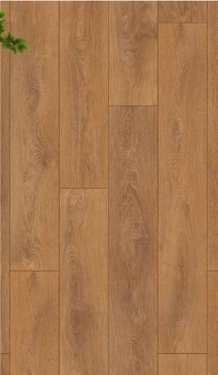
Oak Texas Diner* 1101021840 | 1288 x 195 x 8 mm | plank