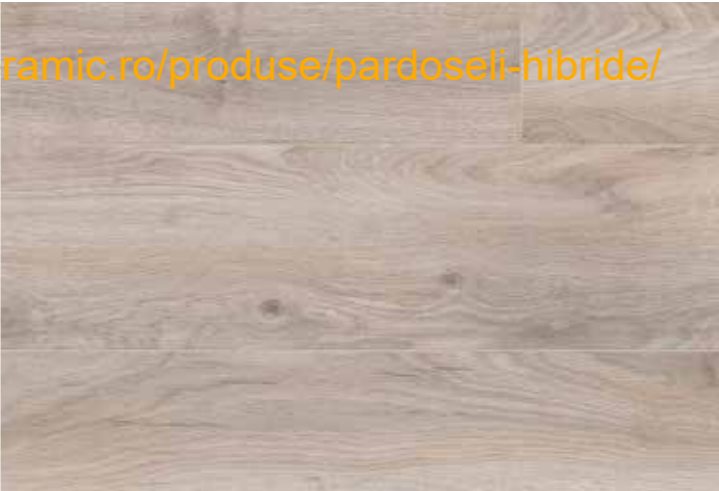
Oak Beach Club* 1101021831 | 2003x245x10 mm | long plank