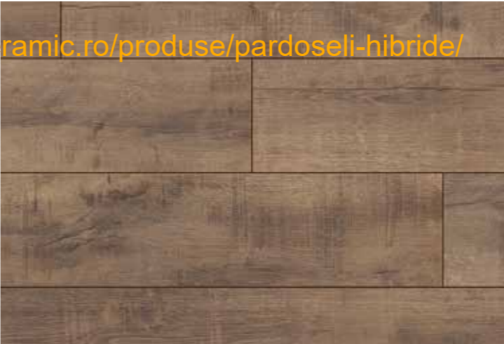
Oak Jazz Club* 1101021821 | 1288 x 195 x 8 mm | plank