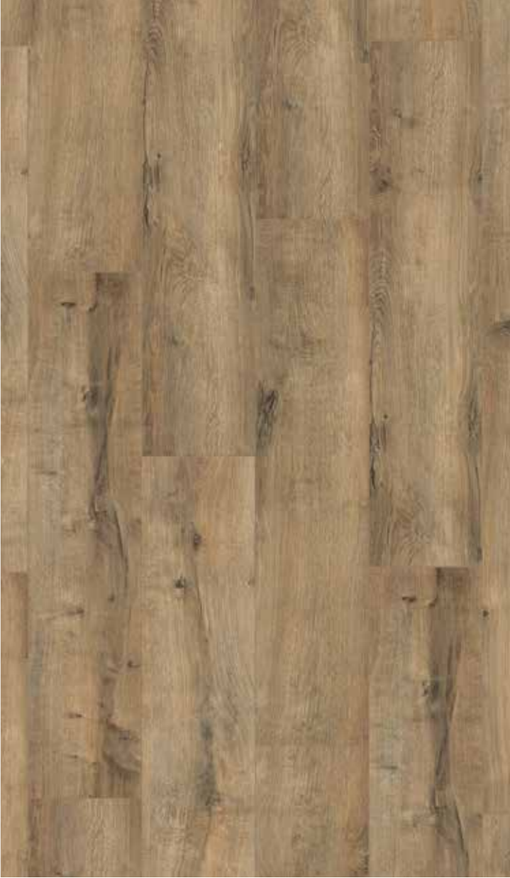
Oak Industrial* 1101021823 | 1285 x 280 x 8 mm | wide plank