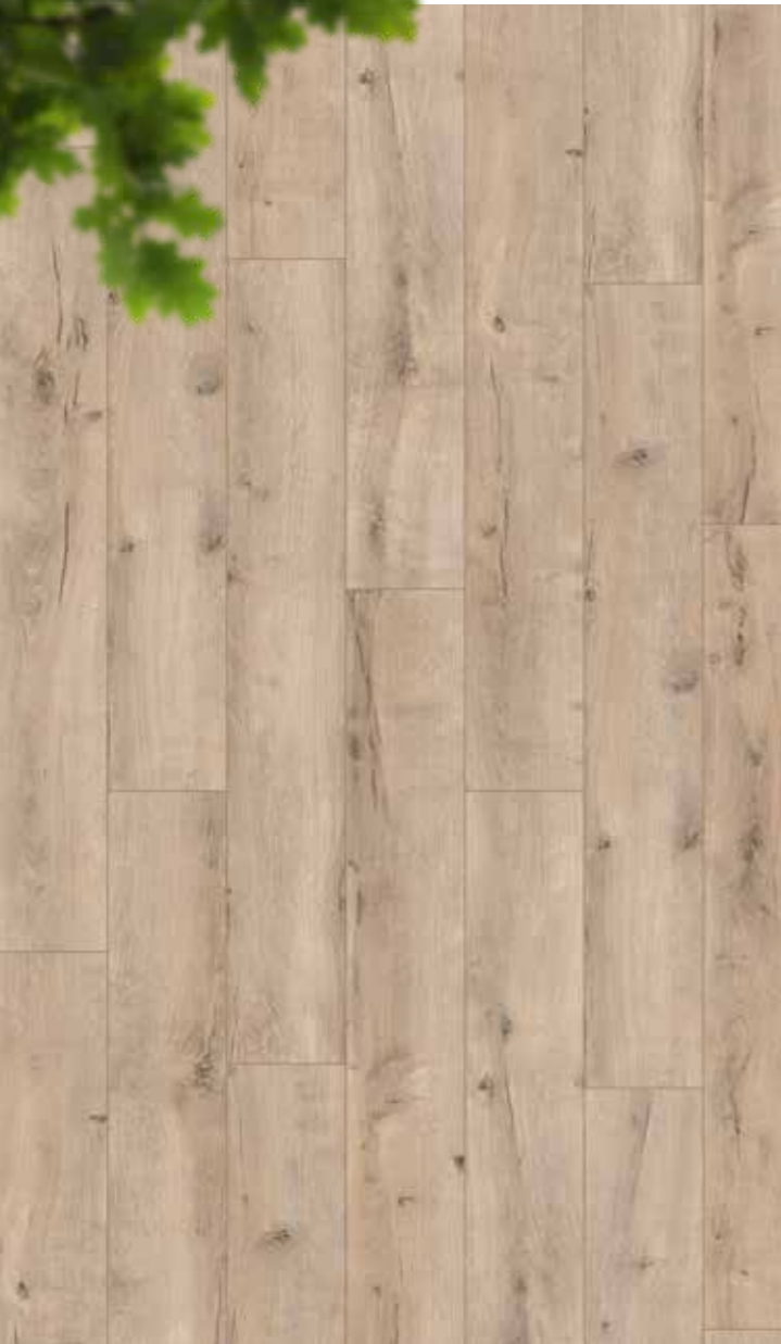
Oak Vintage Boutique* 1101021841 | 1285 x 192 x 8 mm | plank