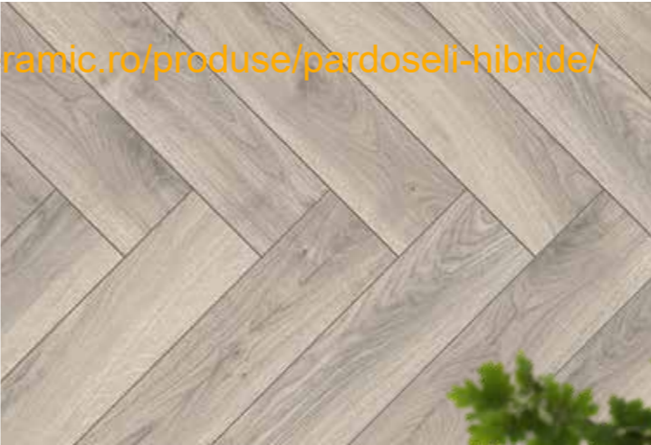
Oak Atelier* 1101021850 | 630x126x10 mm | herringbone