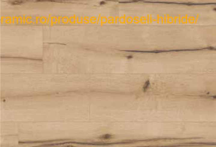
Oak Art Deco* 1101021826 | 1285 x 280 x 8 mm | wide plank