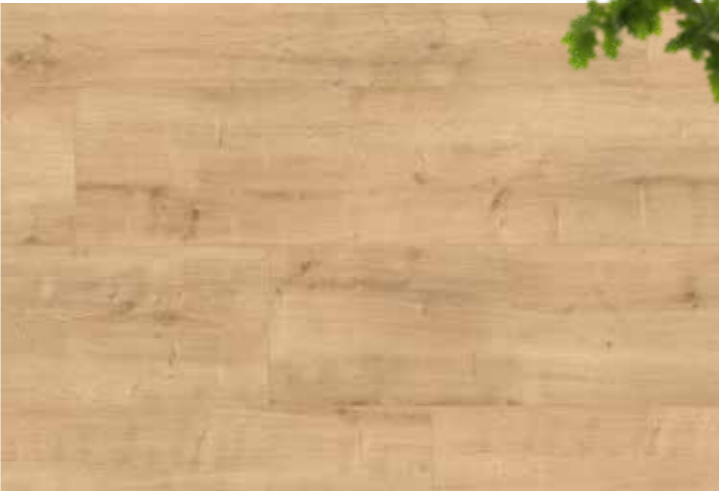
Oak Boho* 1101021822 | 1285 x 280 x 8 mm | wide plank