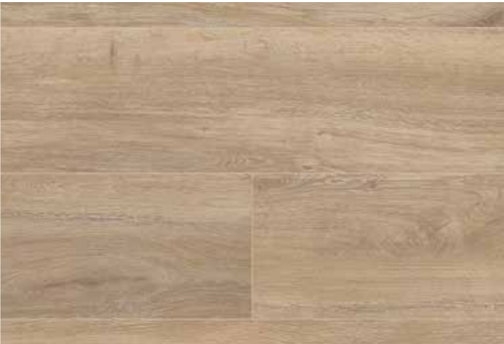
Oak Candy Shop* 1101021829 | 2003x245x10 mm | long plank