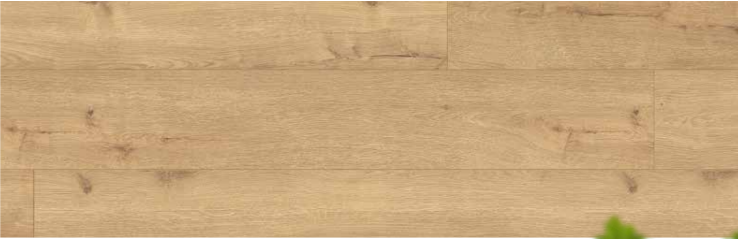
Oak Music Store* 1101021846 | 2003x245x10 mm | long plank