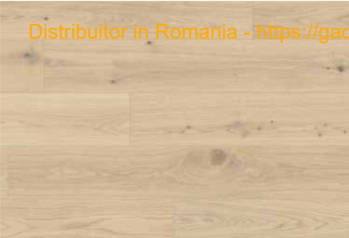
Oak Yoga Studio* 1101021833 | 1285 x 192 x 8 mm | plank