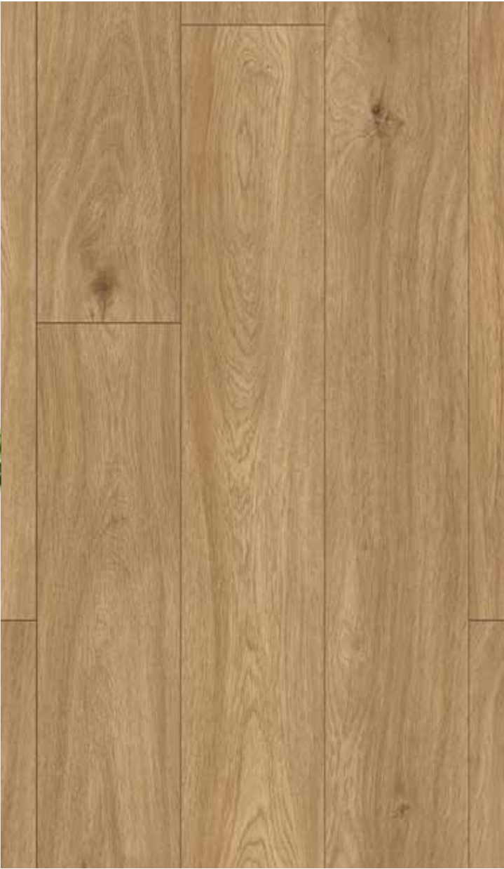
Oak Rooftop Bar* 1101021845 | 2003x245x10 mm | long plank