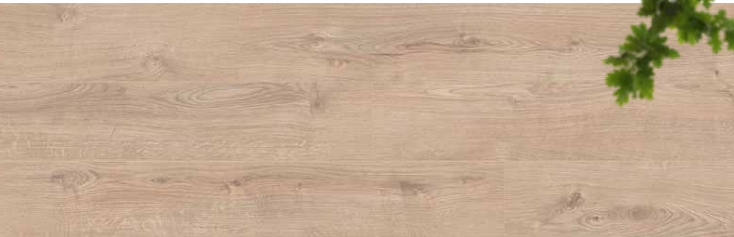
Oak Rock Cafe* 1101021837 | 1288 x 195 x 8 mm | plank

Distribuitor in Romania - https://gadaceramic.ro/produse/pardoseli-hibride/