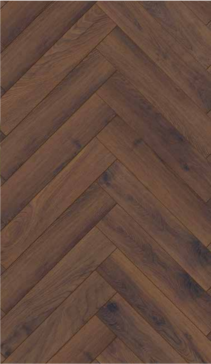
Oak Estate* 1101021852 | 630x126x10 mm | herringbone