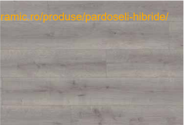
Oak Art Gallery* 1101021839 | 1285 x 192 x 8 mm | plank