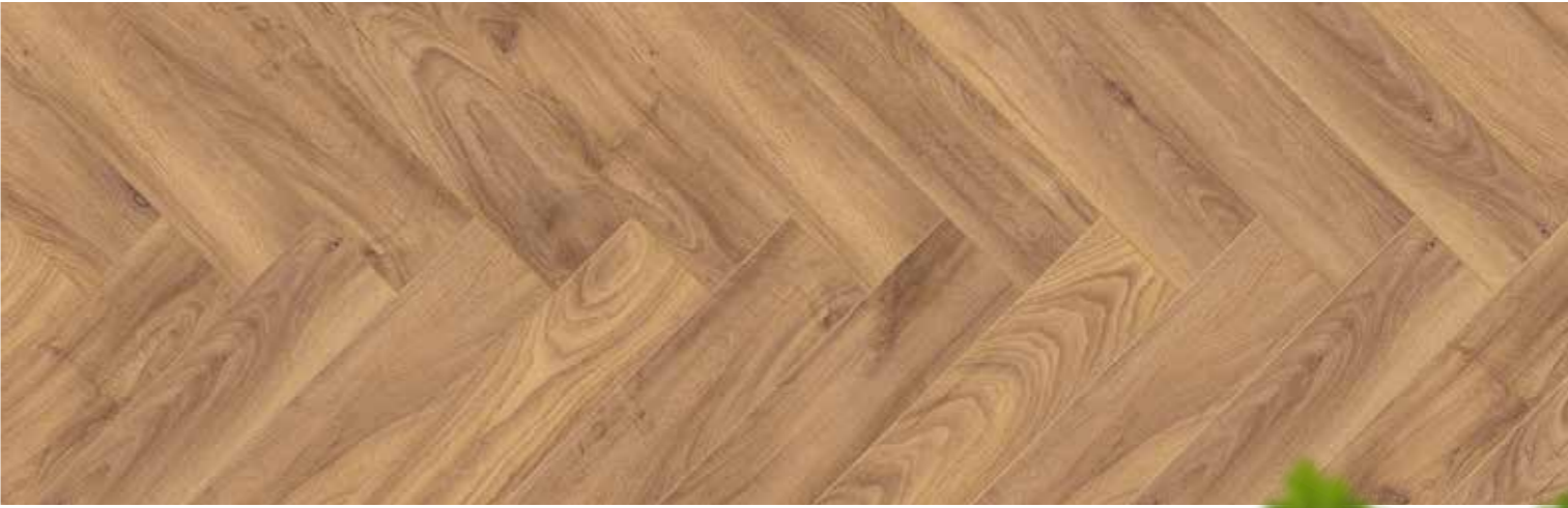
Oak Cottage* 1101021855 | 630x126x10 mm | herringbone