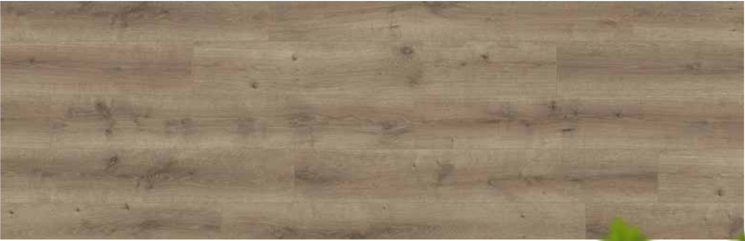
Oak Scotch Saloon* 1101021835 | 1285 x 192 x 8 mm | plank