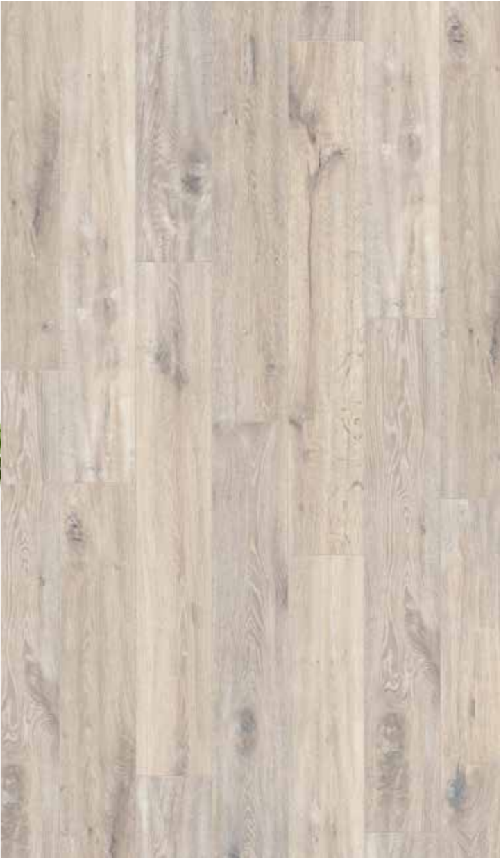
Oak Ice Factory* 1101021836 | 1285 x 192 x 8 mm | plank